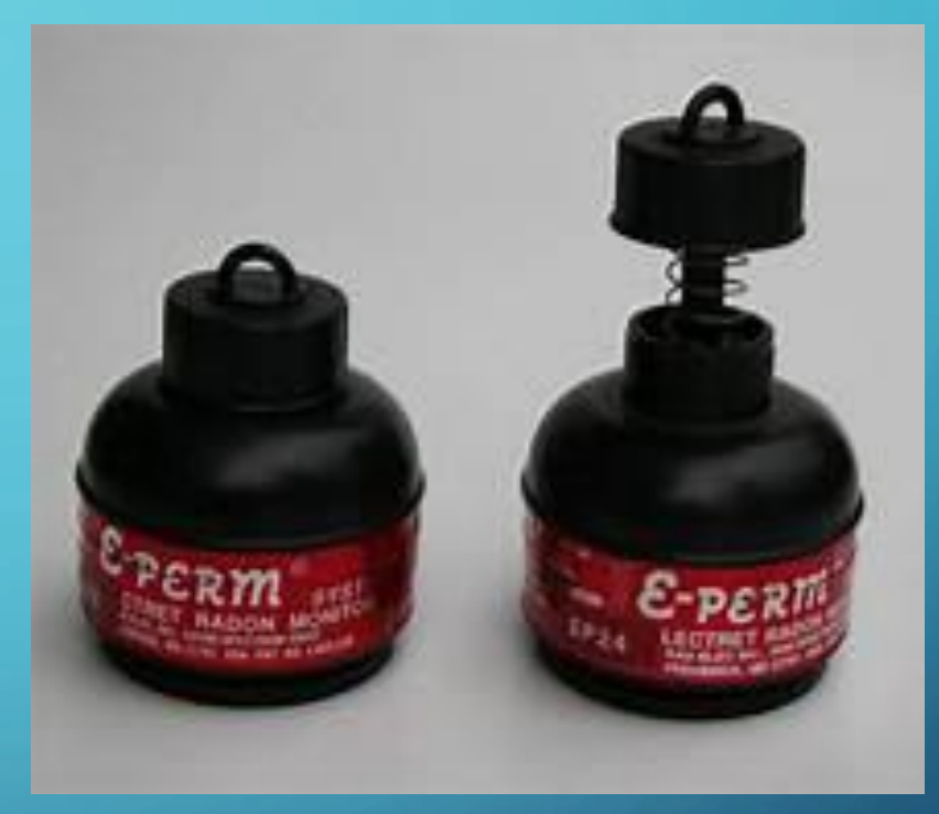
https://tse3.mm.bing.net/th?id=OIP.8 JjJNzdB5Or06y8HWbyacQHaF9&pi d=Api&P=0&w=217&h=175